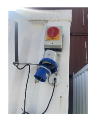
Damage to power inlet