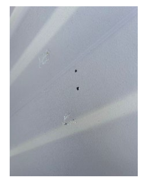
Holes in walls