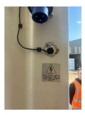
Damage to wiska box