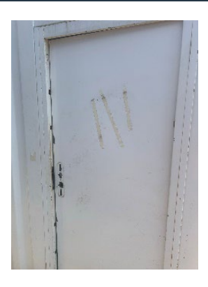
Damage to door/lock