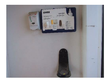
Customer equipment left inside